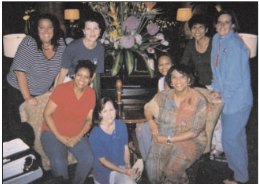
TxHIMA Board members and friends at the 2004 Convention.

As education director, my major goal is to support the TxHIMA constituency by providing opportunities for continued education that meet their needs as well as keep up with the evolving profession of HIM. ☺