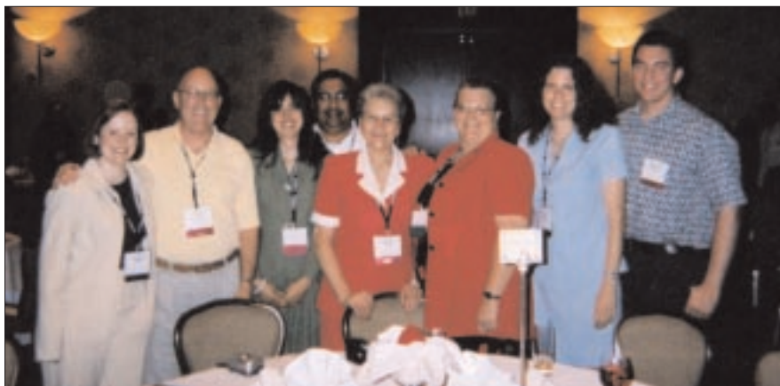
TxHIMA Outstanding Student and Scholarship winners with their guests.

Note: To nominate a student in a HIA or HIT program for the Outstanding Student award, please contact the TxHIMA Executive Office for more information. You must be either an instructor in the HIM program in which the student is enrolled or you have been the clinical site supervisor of the student you wish to nominate.