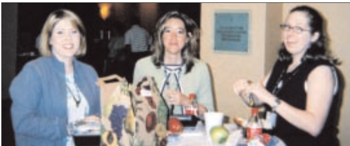
TxHIMA members learning, sharing and eating...a great time was had by all!