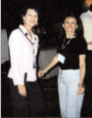
TxHIMA members enjoy the activities of the Installation Ceremony.